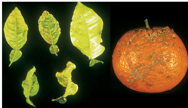
Figure 3. Scab fungus

In some groves, Alternaria has become quite severe and has reduced crop yields. Leaf infection can also be severe resulting in excessive defoliation.