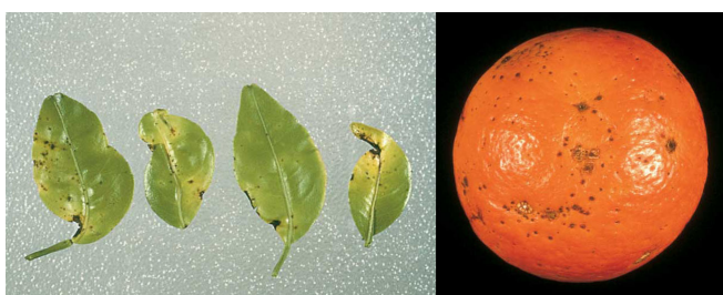
Figure 2. Alternaria fungus disease.

Both the tree and the fruit are susceptible to the Alternaria fungus disease (Figure 2) which can result in defoliation and crop loss unless carefully controlled.